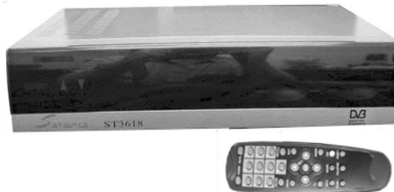
Satellite receiver and remote Model ST3618