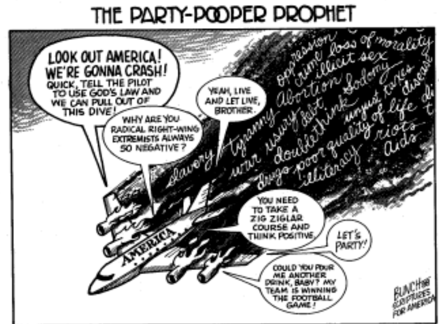
This truthful and timeless cartoon is from the book “A CHRISTIAN GUIDE TO MASS-MEDIA MYTHOLOGY” available for a $6.00 offering from Scriptures for America PO Box 766, LaPorte, CO 80535

Repentance involves a change of thinking.