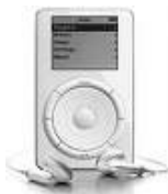
Pod-casts now available at our website

All the Sacrifices of men put together cannot compare with the ANGUISHING SACRIFICE of our Heavenly Father and His only begotten Son, who died that we might live for ever.